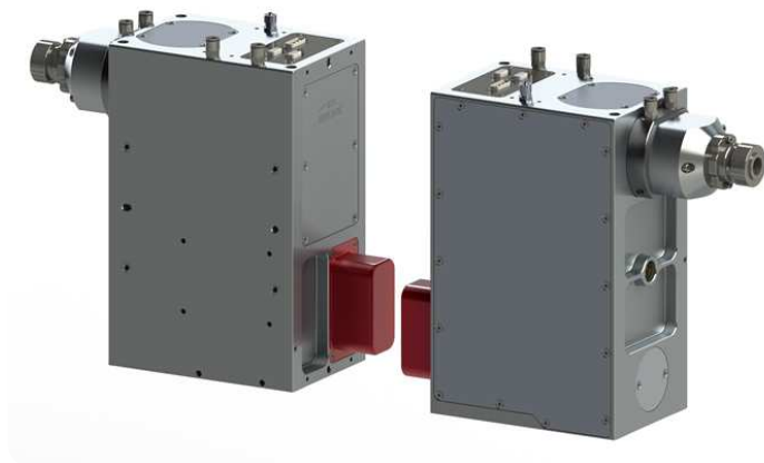
New deflection units AXIALSCAN FIBER-20 and AXIALSCAN FIBER-30

The AXIALSCAN FIBER-20, with its pre-focusing feature, is ideal for boosting the productivity of modern AM powder bed machines. Thanks to its ability to form a quadruple design set up, this deflection unit can increase efficiency 4-fold across the process field. The units are optimised for seamless integration and reliable operation, in particular in powder bed machines (SLM). Process monitoring is also integrated, so that the quality of the AM process can be checked at any time.